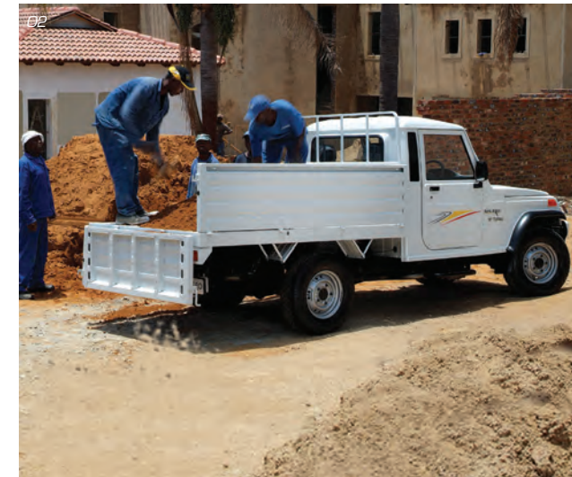
O2 The high walls, fold down panels and easy to clean surface of the load box make it highly functional whatever your load, while the strong chassis provides the ideal base for heavy lifting.