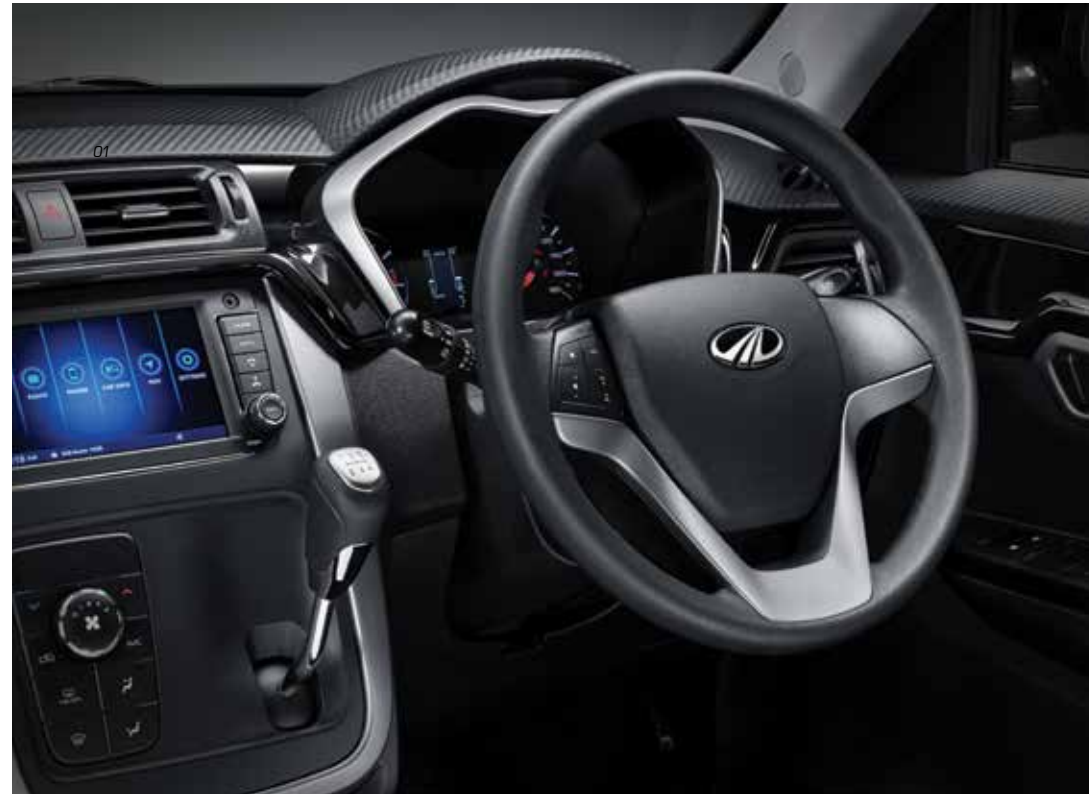
ELECTRIC POWER STEERING WITH STEERING MOUNTED CONTROLS