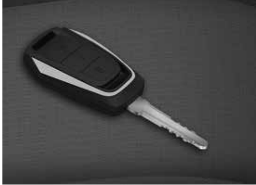
REMOTE KEYLESS ENTRY WITH IN-REMOTE OPENING TAILGATE